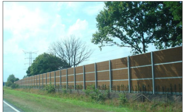
Noise barrier at Enschede - length: 450 metres - height: 4,5 metres

A Kokowall noise barrier radiates warmth and befits any landscape: these are its most typical features. Kokowall is a noise barrier that can be covered with plants; its exterior has been treated with natural and durable coconut fibres. Besides a substantial sound absorption ability, coconut fibres represent the ideal point of attachment for climbers. Within a few years' time, a Kokowall noise barrier will be fully grown over.