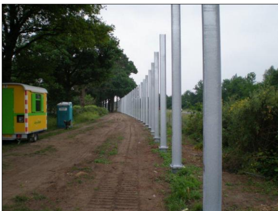
Installation of uprights