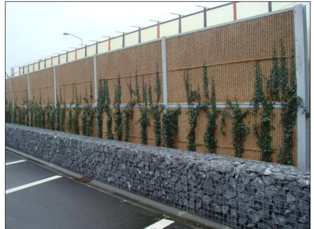
Kokowall Noisebarrier in Amsterdam Z-O, H=3m

Concrete barriers or banks cannot be placed everywhere due to their weight and size. The foundation of the Kokowall noise barrier is actually very narrow, thereby ensuring relatively little loss of space. The lightweight and modular construction of the Kokowall noise barrier ensures a quick, low-cost assembly process.