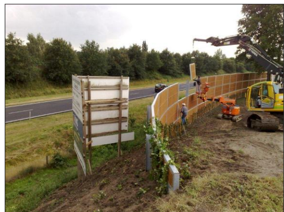
Installation of panels