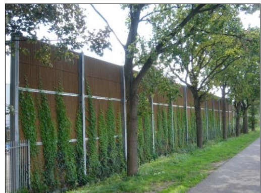
Kokowall Noisebarrier in Vianen, l=200m 3-6m height

A heavier sound insulating plate can be applied if a very high noise reduction is required. The Kokowall barrier is also available as a visual barrier without the noise insulating properties. This barrier comes equipped with one row of tubes without an insulating plate and serves as a visual partition.