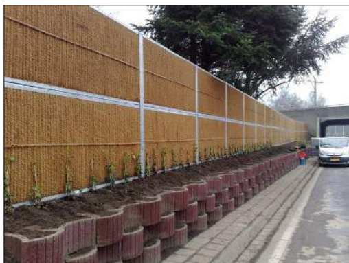
Kokowall Noisebarrier in Weert H=3m, l=50m