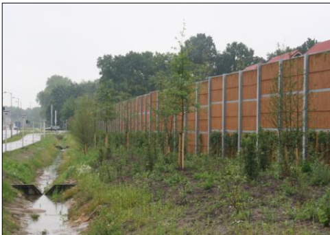
Kokowall Noisebarrier in Enschede, l=200m 5m height.

The Kokowall noise barrier has been constructed modularly which guarantees a quick assembly process. Prefab panels placed within a steel construction of HE-A columns allow for climbers to be planted on both sides of the barrier. The Kokowall noise barrier's simple construction turns each job into a quick assembly project as well as an economical one.