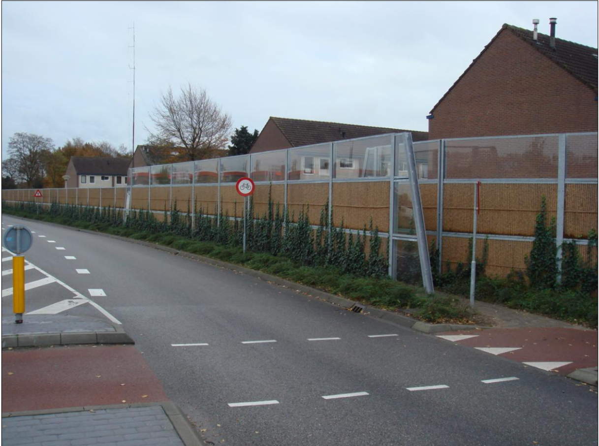
Kokowall Noisebarrier 2,5m height in Ommen